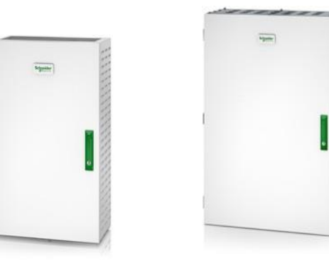
Classic battery cabinets